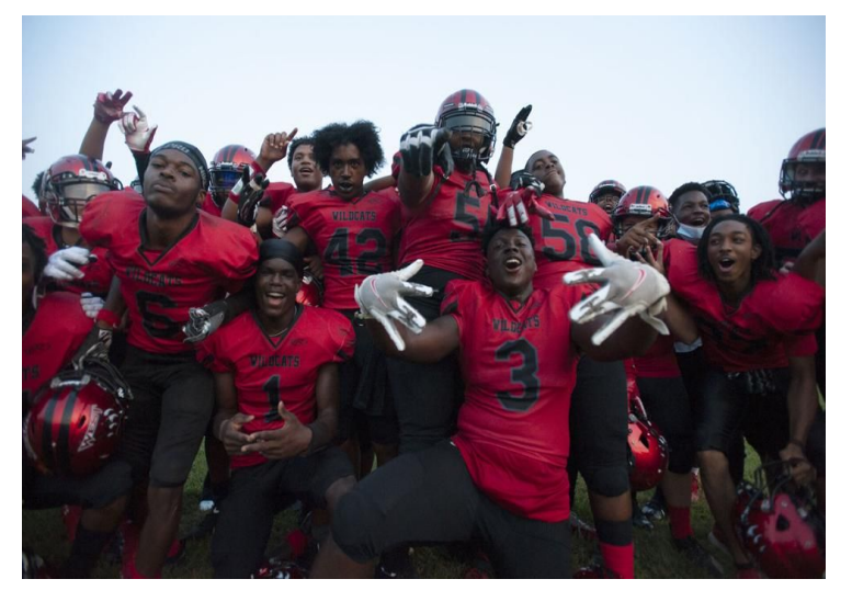
The Hazelwood West team celebrates after a football game on Friday, September 10, 2021 at Hazelwood West High School in Hazelwood, Mo.